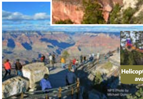
Helicopter upgrade available.